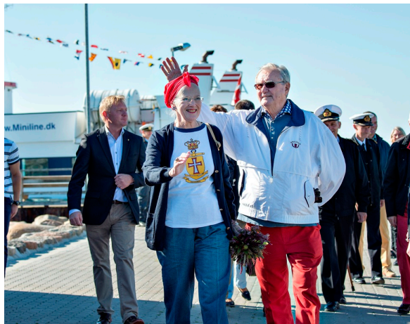
The Queen and The Prince Consort arrive at Livø Harbour.