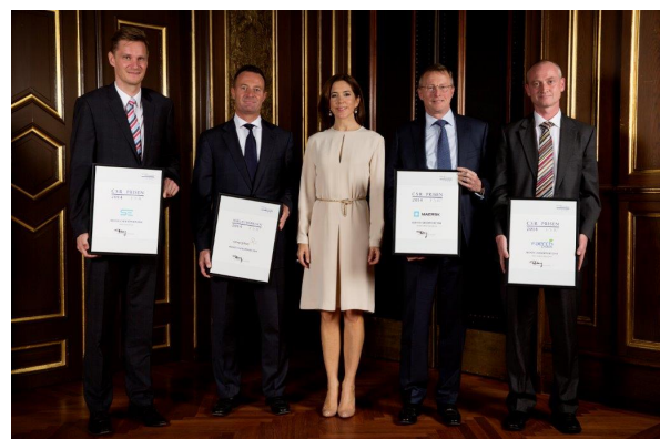
The Crown Princess with prize recipients at FSR - danske revisorer's award presentation for Denmark's best CSR reporting.

The Crown Princess presided over the 6 October prize presentations at Børsen in Copenhagen during FSR -