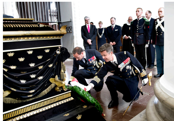
TRH The Crown Prince and Crown Prince Haakon laid wreaths at Christian VIII's coffin in Roskilde Cathedral in connection with the 200th anniversary of the Norwegian constitution.

The 200th anniversary was also marked on Danish soil, and, on 21 May, The Crown Prince visited the Norwegian frigate KNM Helge Ingstad at Langelinie in Copenhagen and later in the day participated in the opening of the special exhibition "Under a Common Flag" at The Royal Danish