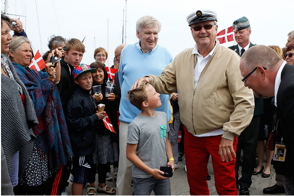
The Prince Consort visited Tunø Festival on 3 June.