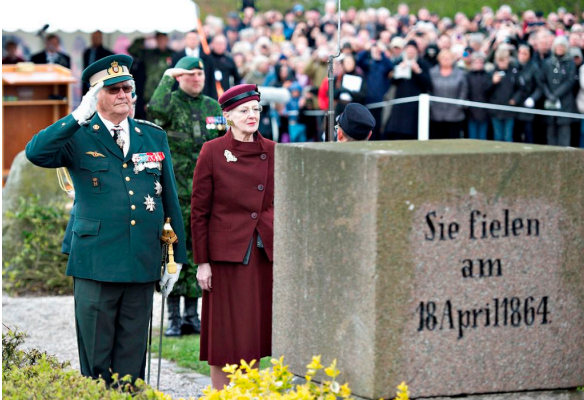
During the military memorial ceremony, The Queen and The Prince Consort laid a wreath at the mass graves.