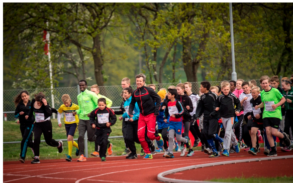
The Crown Prince during the warm-up for the School Olympic Games in Korsør.

The Crown Prince was also present at events affiliated with the nationwide School Olympic Games, in which local school classes across the country can qualify for a final