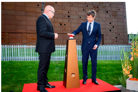
The Crown Prince presided over the opening of The Energy Tower in Roskilde.

On 22 June, The Queen presided over the opening of the conference EuroScience Open Forum 2014 in Copenhagen, and later in the year, on 23 September, The Queen, in her role as patron, was present for the opening of the Danish Technological Institute's new research domicile for the Danish Meat Research Institute (DMRI) in Taastrup, which will make its mark as the world's largest knowledge centre