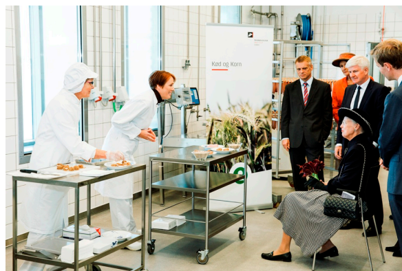
The Queen was introduced to healthy meat products during a visit at the Danish Meat Research Institute.