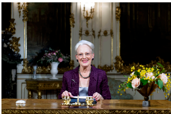
More than two million TV viewers watched when The Queen, on 31 December, delivered the New Year's address from the Garden Room at Fredensborg Palace.

The year's incoming state visit took place the days of 17-19 March, when Turkey's president, HE Abdullah Gül, and First Lady Hayrünnisa Gül paid a visit to Denmark. A Turkish business delegation accompanied the Presidential Couple during the state visit, which focused on green growth and technology, health care and welfare, and the food production and agro-foodstuff industries. The visit involved several activities that presented Danish business, and The Crown Prince participated with the President in a Turkish-Danish trade and investment forum at the Confederation of Danish Industry. On 18 March, HRH The Crown Princess hosted a luncheon for the First Lady, where selected projects under The Mary Foundation were presented, and, following that, they visited victims of domestic violence at the crisis centre Danner for women and their children exposed to violence. Here, The Mary Foundation distributes rucksacks with personal items, such as toys for children arriving at the