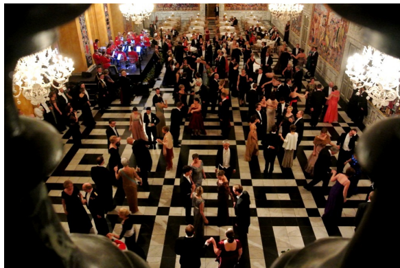
At The Queen and The Prince Consort's evening party at Christiansborg Palace, lancers were danced after the dinner.

Once, during each parliamentary session, TRH The Queen and The Prince Consort invite the government, the Danish