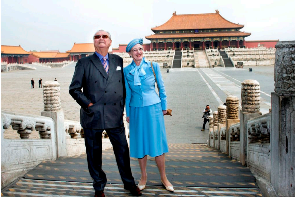
The Queen and The Prince Consort at The Forbidden City in connection with the state visit in China.