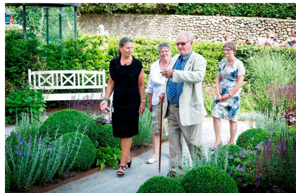
The Prince Consort is shown around in the "Therapeutic Gardens".

On the occasion of the 150 anniversary of the Red Cross, The Prince Consort, in his role as patron, made the Orangery at Fredensborg Palace available for a charity dinner. The Queen and The Prince Consort, together with the Crown Princess, Prince Joachim and Princess Marie, participated in the charity dinner on 11 September. Since