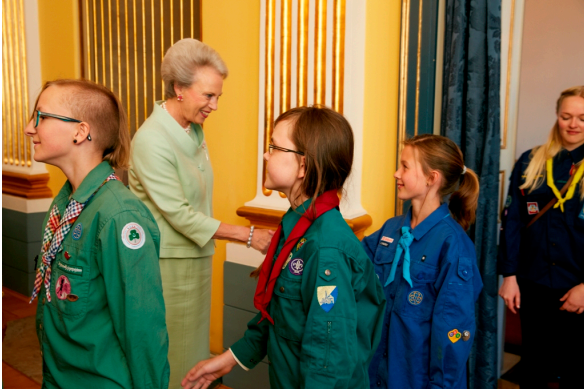
Princess Benedikte greets guides from The Green Girl Guides of Denmark and The Danish Guide and Scout Association in connection with her reception in Christian VIII's Palace on the occasion of the Princess's 70th birthday.