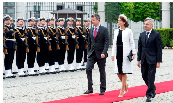
The Crown Prince Couple during the official welcome at the Polish presidential palace in connection with the official visit in Poland.

The Crown Prince Couple, from 12-14 May, paid an official visit to Poland's capital, Warsaw, and to Stettin, where they led a Danish business promotional campaign. With the objective of promoting Danish-Polish trade in agriculture and food products, fashion and design, energy and environment, and health care, the Crown Prince Couple participated in a number of activities putting into place the conditions for knowledge sharing between Danish and Polish companies. On 12 May, the Crown Prince Couple participated in a "Grand Opening" of Danish business initiatives, after which The Crown Prince, in the course of the following days, took part in several seminars on effective development of, among other things, wind and hydropower in country and city areas. During the visit The Crown Princess participated in several activities connected with the promotion of health, including a seminar on lifestyle diseases and a visit at a local hospital. The Crown Princess also visited a kindergarten for children with autism and later took part in a round-table meeting on Danish experiences with cooperation between the public and private parts of the health care sector as well as a seminar concerning improvement of quality of life. The visit in Stettin dealt with, not least, environmentally-sound solutions, and The Crown Prince took part in seminars dealing with wind energy and