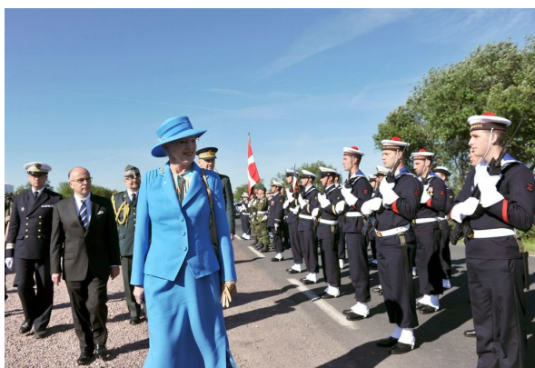
The Queen at the memorial ceremony on the occasion of the 70th anniversary of the Allied invasion of Normandy.

On 26 September, The Queen held a Medal Dinner for army officers at Fredensborg Palace in which The Crown Prince and Prince Joachim also participated. The Queen and The Prince Consort attended the 17 November celebration of the Hussar Guard Regiment's 400th jubilee in Slagelse, where