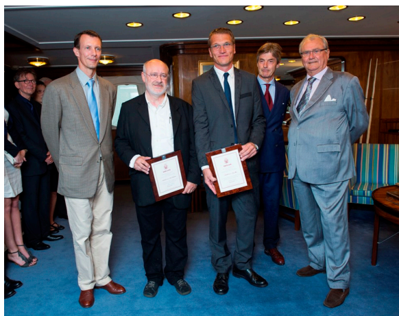
The Prince Consort and Prince Joachim on the Royal Yacht Dannebrog after presentation of the Danish Europa Nostra Prize 2014.