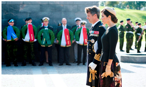
The Crown Prince Couple participated in a wreath-laying ceremony at Kastellet, Copenhagen.