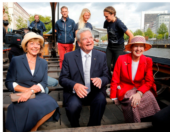
During the visit in Berlin, The Queen, German President Joachim Gauck and Ms Daniela Schadt were shown the Viking ship "Sea Stallion".

In 2014, The Prince Consort was the patron of the year's Tunø Festival and visited the island on 3 July to attend the