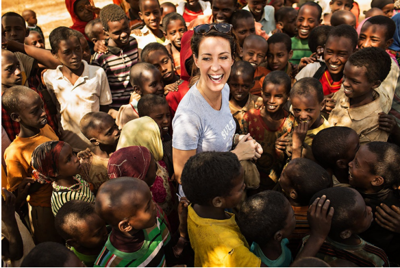
In Ethiopia, Princess Marie visited the village Jibri to see the local school's new water collection facility, which ensures that periods of drought and water shortage do not keep the students away from schooling.