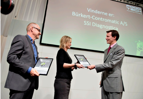
Prince Joachim presents the FoodTech Award at the opening of the trade fair FoodTech 2014.