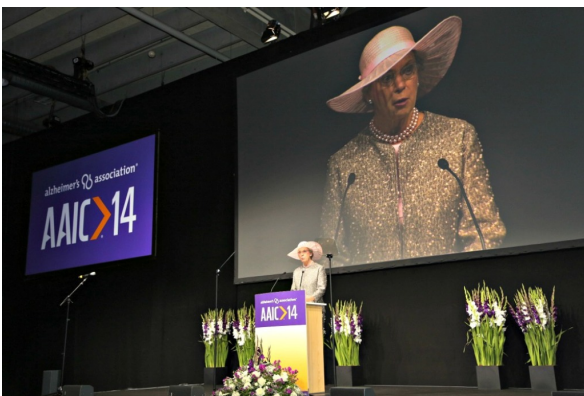
On 13 July, Princess Benedikte, in her role as patron, opened the "Alzheimer's Association International Conference" in Copenhagen.

Back in Denmark, The Crown Princess spoke at an international conference at Christiansborg Palace on 11 November on the circumcision of girls. At the conference, international global stakeholders participated and shared information about political progress, newest research results and experiences as well as continuing challenges. In connection with the conference, The Crown Princess was the host at a dinner in Frederik VIII's Palace, Amalienborg.