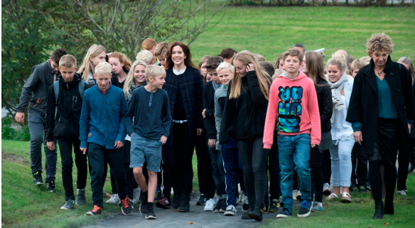
The Crown Princess took part in a town walking tour with two school classes in Næstved in connection with "School for 200 Years".