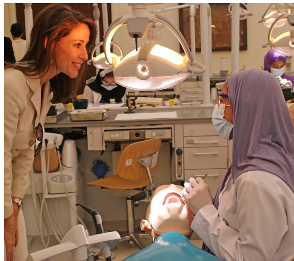
The Princess visited dental students training on dummies at Princess Nora Bint Abdulrahman University in Riyadh.

On 13 August, Princess Marie, together with Minister of Education Christine Antorini, visited Tønder HTX, where there is targeted work with creating a "girl-friendly environment" in IT education, and was introduced to an education course. On 27 August, Princess Marie was in charge of the official opening of European School Copenhagen, which the Princess entered into cooperation with in 2014 to assist in strengthening the familiarity of the school's educational offers and other efforts. European School Copenhagen is a new multilingual and multicultural international school with focus on language and science from the introductory schooling age up to and including