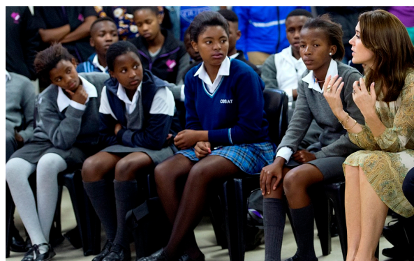
In South Africa, The Crown Princess visited the LoveLife Youth Centre that works with education and knowledge on HIV/AIDS among young people.

In continuation of the sojourn in South Africa, The Crown Princess paid a visit to Geneva, Switzerland on 6 November to participate in meetings and give a speech at the opening of the UNECE/UNWOMEN conference "Gender Equality and Empowerment of Women and Girls for Sustainable Development in the ECE Region", which focused on women's and girls' particular rights and challenges in crises and conflict situations.